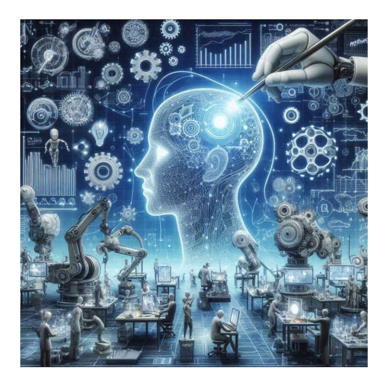
Image 1: Production Processes of Creative Innovations with Artificial Intelligence

innovative products to the market in a shorter time and gain a competitive advantage. Al also minimizes production faults and improves quality control processes; this contributes to general production processes becoming more reliable and sustainable as well (Kantürk, 2022).